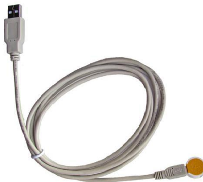
Fig.3. Water Electrode with External Inductor